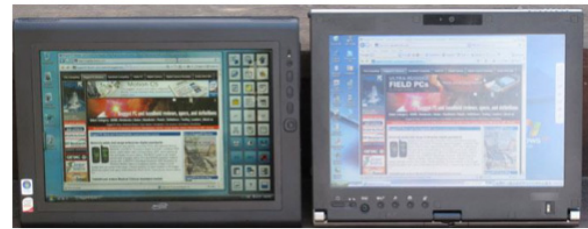
Image 2: Optically bonded display (left) versus AG air-gapped display (right)