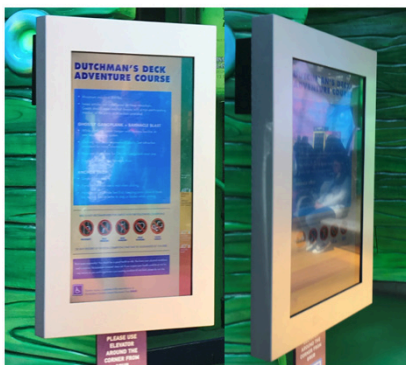
Image 1: External reflection image clarity issues (left) are exasperated when approaching display from an angle (right).

Choosing a cover plate with smart coatings alleviates this problem through enhanced visual performance of engineered optics. Over the years, Tru Vue Inc. has developed and commercialized smart coatings: anti-reflective, non-glare, and anti-static enhancements for customers to protect and conserve everything from fine art to electronic components. Such display enhancements are possible through the interplay of surface-optical properties applied via wet and sputtered deposition techniques. Non-glare (NG), Anti-glare (AG), and anti-reflective (AR) solutions reduce image distortion from reflection when applied to glass or hard clear plastic. NG & AG use diffusion mechanisms, which impact the readability and clarity of the image you are trying to read. AR coatings, on the other hand, incorporate multiple thin film layers to create a clear transparent coating with minimum reflection. Reflection may also be reduced through optical bonding of a cover plate during fabrication of the digital display. As illustrated in Image 2, optical bonding eliminates internal reflections due to an air-gap between the cover plate and internal surfaces.